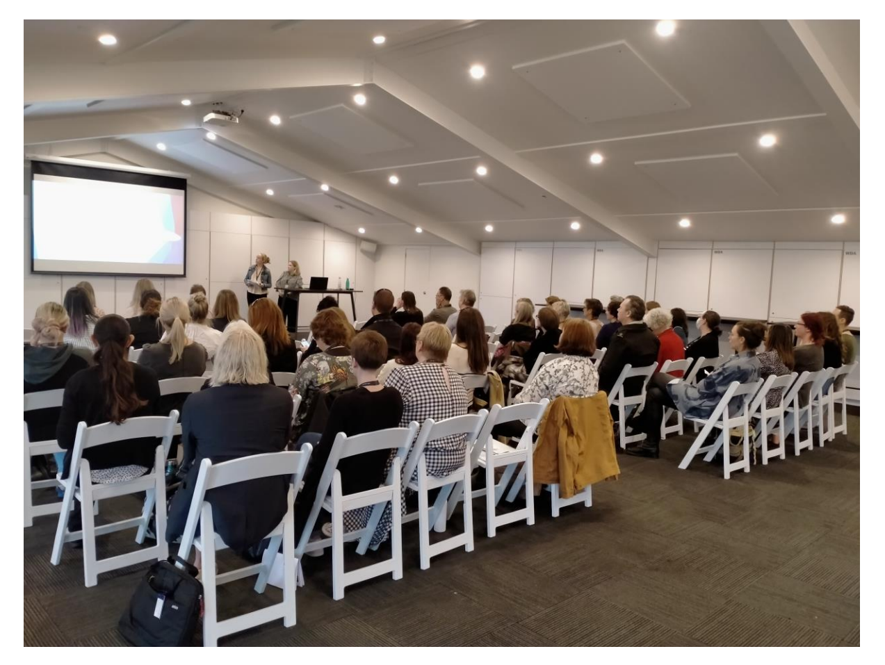
Attendees at the 2022 Symposium in Wellington