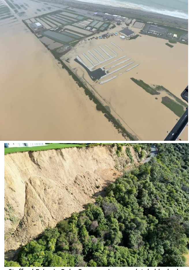
Stafford Drive in Ruby Bay remains completely blocked by a huge slip

www.nzno.org.nz/groups/sections/flightnurses