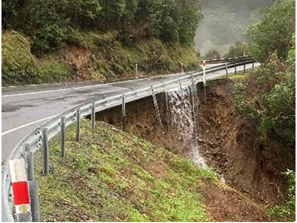
The state of the Whangamoa's – main route between Nelson and Blenheim