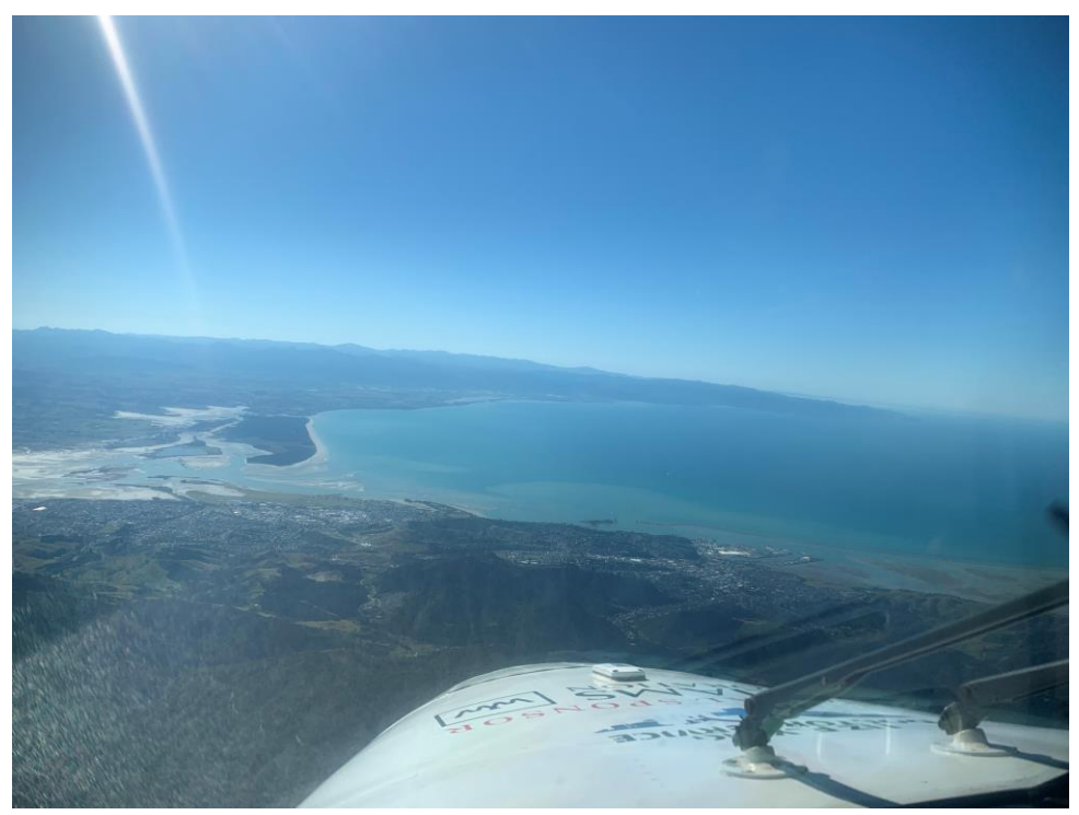
The Nelson Region on a good day!!